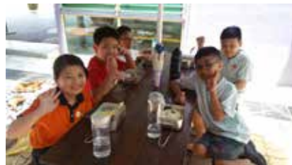
▲ They took a tour around Tampines Fire Station.