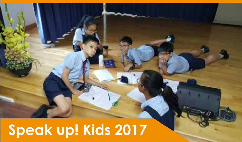
Speak up! Kids 2017

◀ The students are all ready for a good battle of words.