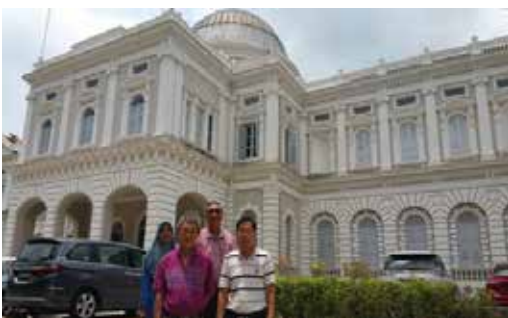
▲ Administrative and support staff at the National Museum.