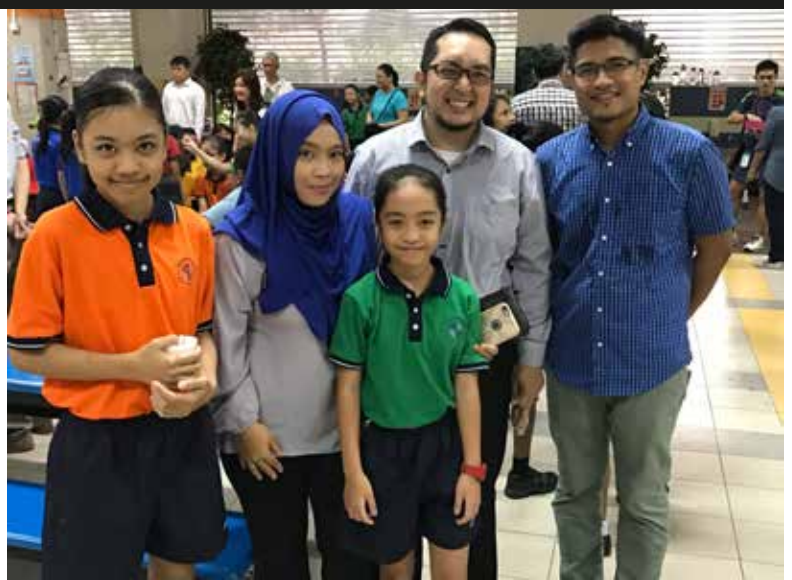
▲ This is the second year that the school has organised this event for parents and their children.