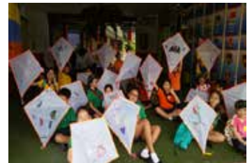
▲ Students designed and flew kites at Marina Barrage.