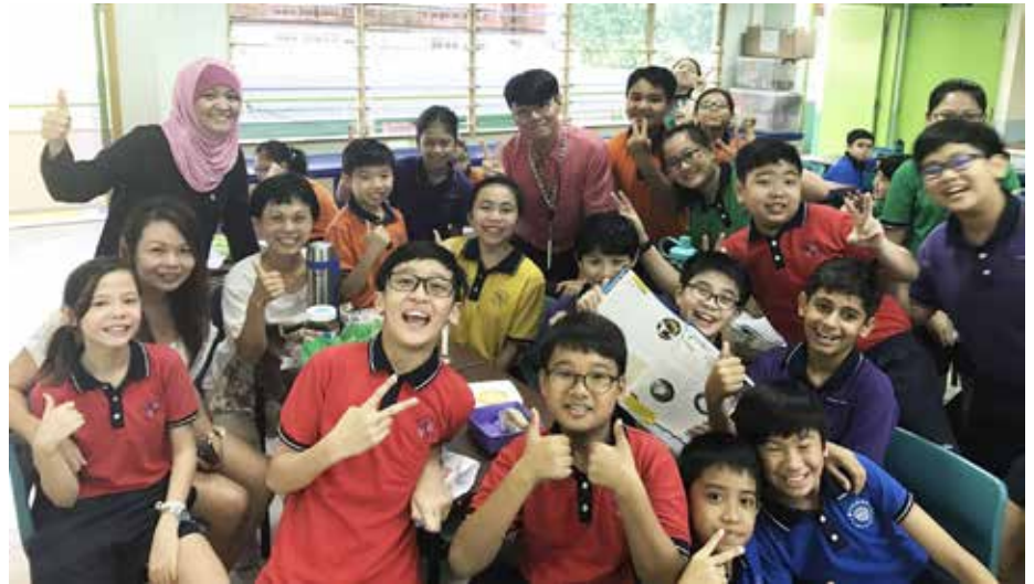
▶ The students from P2 to P6 were excited and happy to have breakfast with their parents in school.