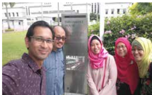
▲ Learning journeys are done in small groups with like-minded colleagues to select and visit a place of their interest.