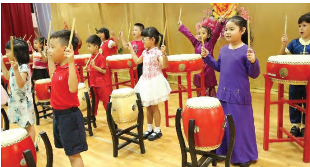
▲ Our P1 students displayed their musical skills in Chinese drums.

The annual CNY Food Donation Drive was organised as part of the school's effort to contribute to the community. Members from Cub Scouts CCA, student leaders and parent volunteers helped to collect and pack food items and distributed them to families living in the Pasir Ris neighbourhood. It was indeed a meaningful and enriching activity for all teachers and students.