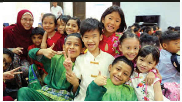
▲ The many colourful ethnic clothes liven up the festive mood.