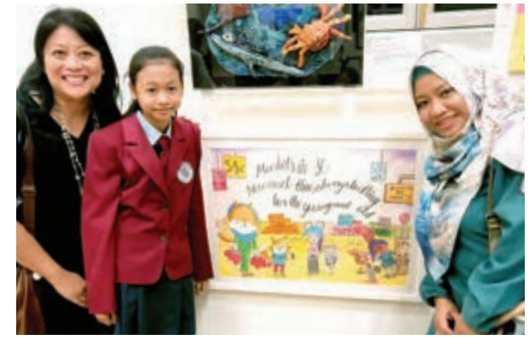
On the exhibition launch day on 5 July at the National Museum of Singapore

The SYF Art Exhibition is a bi-annual event that involves all primary schools in Singapore. This year, 13 students from Art Club CCA submitted two artworks, entitled, 'Market Haiku' and 'A Tale of Two Childhoods' for the competition. We are proud to achieve the Certificate of Recognition for one of our entries. Well done, Meridians!