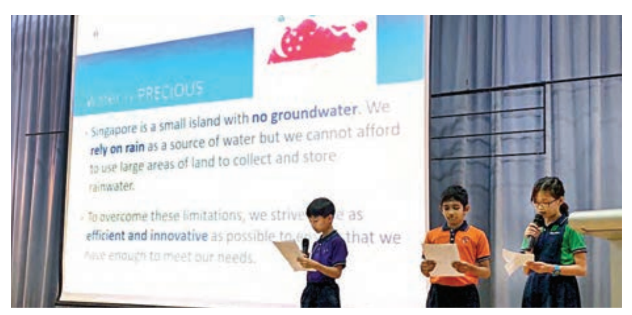
Presenters from 5 Integrity (Climate Change)