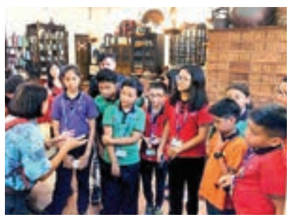
The kitchen in a Penang Peranakan Museum which is as big as a 3-bed room flat