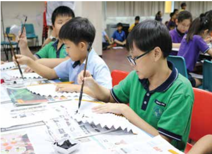
▲ P4 students trying out fan painting using calligraphy.

▼ The students made a simple fruit salad using the 3 fruits and Kolakattai (a traditional Indian sweetmeat) with the help of parent volunteers who also contributed with some valuable ideas.