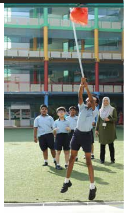
▲ The students trying their hands at Uri Adittal

On 1 November, the school celebrated Deepavali with a bang! During the Deepavali bazaar, students got to try their hands at cultural activities like flower-tying, henna painting and also Rangoli Art. Some played Uri Adittal, a Pinata-like game where they have to be blindfolded to break a suspended clay pot, others tried traditional board games like Paramapatham.