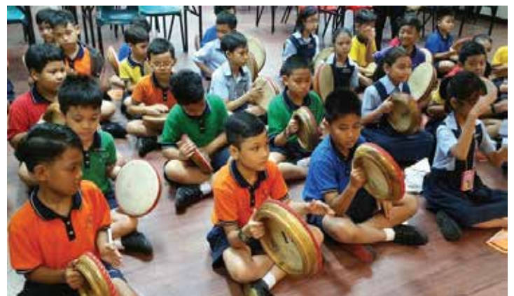
▲ P3 and P4 learning the musical instrument (kompang) and choral singing (dikir barat)