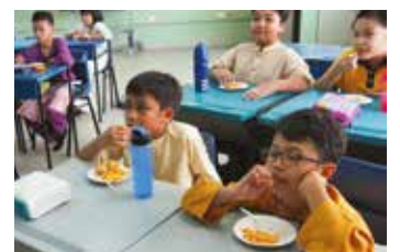
▲ Munch...Munch... On some of the ethnic delicacies.

Racial Harmony Day was commemorated on 21 July. Students and teachers came dressed in colourful multicultural outfits to show their appreciation of the various ethnic cultures. Students were engaged in a series of activities to learn the importance of harmony, and to appreciate the diverse cultures and heritage of Singapore.