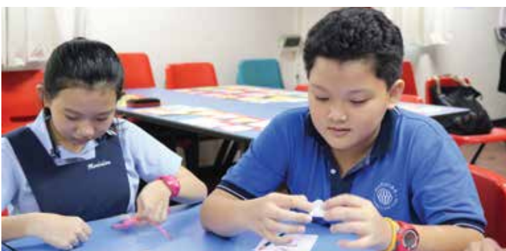
▲ P6 students completing their hands-on activity of knot-tying.